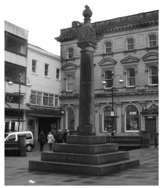
Huddersfield Market Cross.

In the market place, at the heart of the town is a market cross. It may well be the oldest visible part of the town, dating from about 1671 when the Ramsden family acquired a market charter. Is it art? It was a symbol of authority, it marked the centre of market franchise rights for a radius of 6<sup>2</sup>/<sub>3</sub> miles. The cross can also be decoded as such; its structure representing social order. It is topped with a stone orb representing monarchic supremacy, beneath that is a cube depicting Ramsden armorial bearings indicating the marriages with other landed families; this is borne high above us by an orderly decorated circular stone column with an lonic capital, literally keeping the hierarchy in an elevated position. At the foot are plain steps spreading out, the lower orders taking the strain of all above.