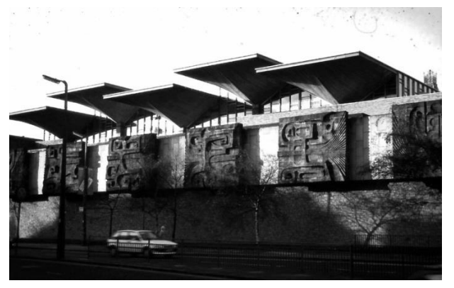
Fritz Steller, Articulation in Movement (1969).

A later development phase was the 1970 market hall, abounding in examples of public art. The pioneering canopy of the elegant market hall have been described in many terms; as 'sculptural', 'flowing', 'poetic', 'stunning', 'modernist interpretation of Gothic', 'cathedral-like', 'dull concrete', 'dismal', 'greying concrete'.<sup>7</sup> The project architect Gwyn Roberts (1936-2004), of the Seymour Harris Partnership) wanted to have an interesting roof structure which would return to the traditional concept of the market place with rough wooden stalls shaded but not enclosed by a canopy. From the interior the roof scape is indeed poetic; the twenty-one freestanding roof shells are more decorative than practical; sculptural, asymmetric, carefully parallel board-marked and well lit. The Queensgate façade of the market hall displays five roof shells. Beneath, against the outside wall are nineteen shop units that vary in depth alternately, so that from the outside the first floor is indented delineating each trading space emphasised by ceramic panels by Fritz Steller (b. 1941) of Square One Design. The nine relief panels (18ft x 18ft) are presented proudly between smooth ashlar stone. The panels continue across the façade, nine panels with ten ashlar intervals. Much of it is now hidden by trees that have outgrown their place in the scheme.